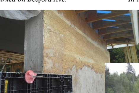
Building of the hempcrete shrine house