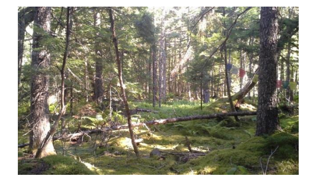
In the woods surrounding the Shambala, the earth is very Soft with thick moss loved by the moles, owls and bears.

The dining hall was ideally suited for sun exposure and easy installation. All the materials to rebuild the panels